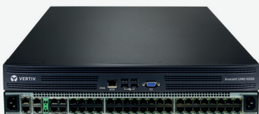
Avocent® Universal Management Gateway 6000